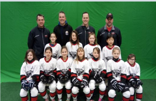
Surrey Novice C2