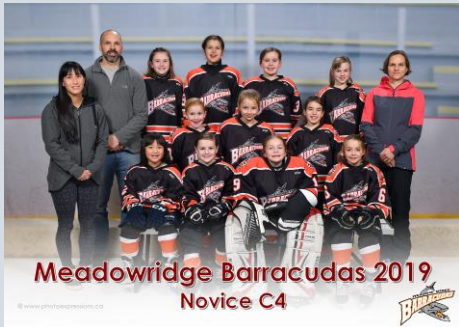
Meadow Ridge Novice C4