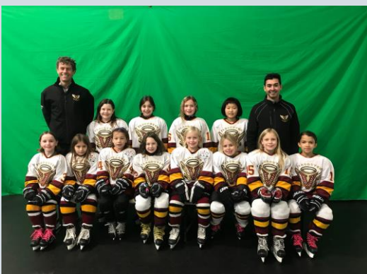
Vancouver Novice C1