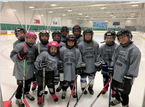
Surrey Novice C1