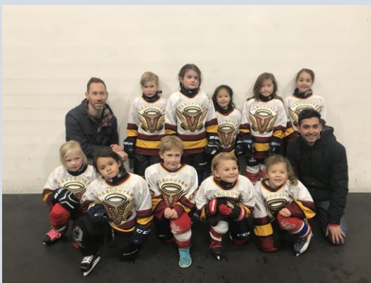
Vancouver Initiation C1