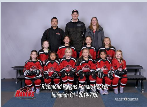
Richmond Initiation C1