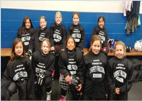
Surrey Novice C3