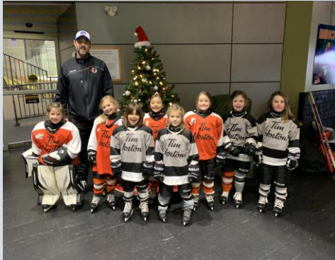
Meadow Ridge Initiation C2