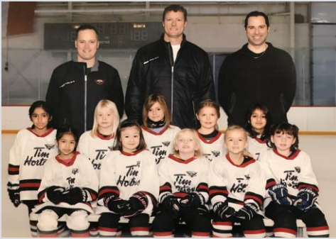
Surrey Initiation C2