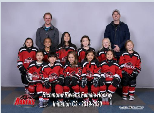
Richmond Initiation C2