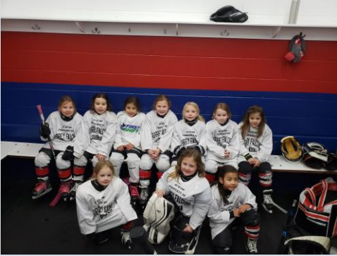
Surrey Initiation C1